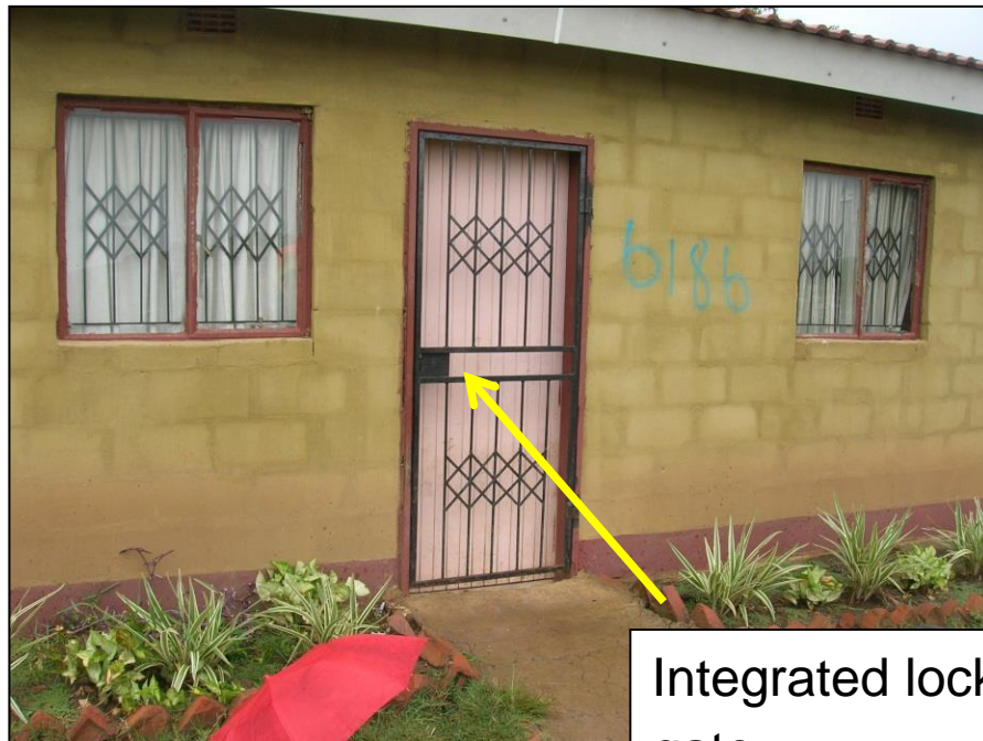
Integrated lock on gate

“We have got the street light, even the passages are clear to walk [along], even at night. ..there is no place for criminals to hide. All people who live in this area belong to this area”. (FG ♀, 2011)